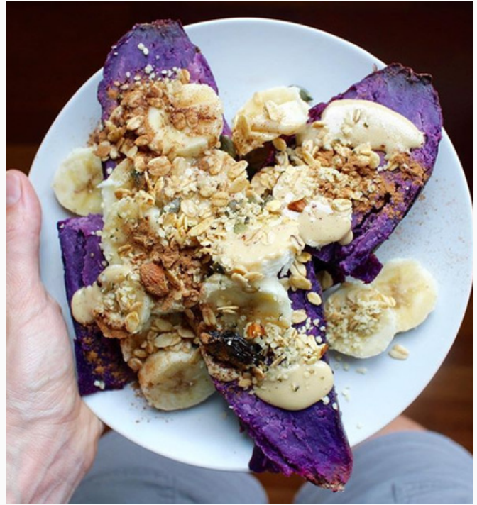
Top a baked sweet potato with sliced banana, nut butter and nuts, seeds or granola