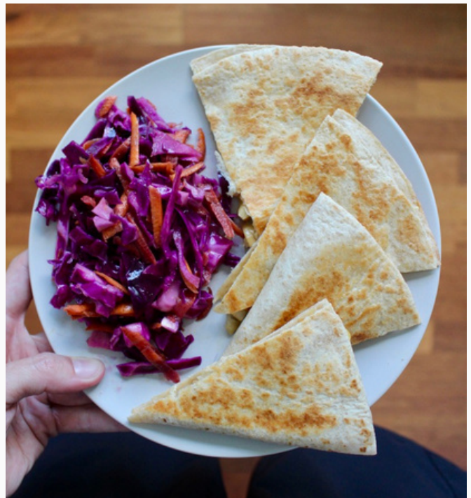
Chop the marinated tofu and roasted veggies into small pieces and use them in a quesadilla. Pair with coleslaw.