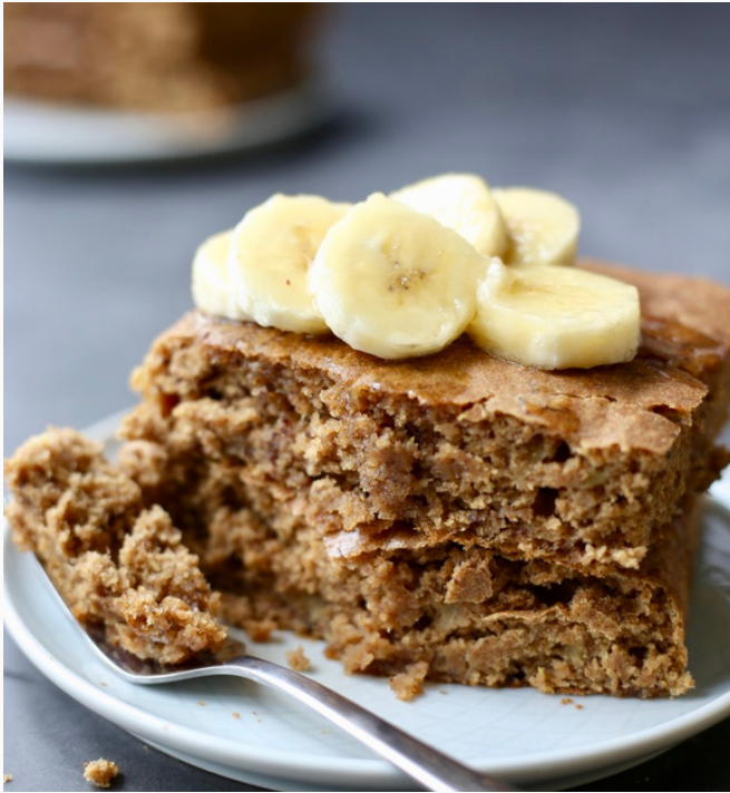
Top a sheet pan pancake with nut butter, fruit and syrup.