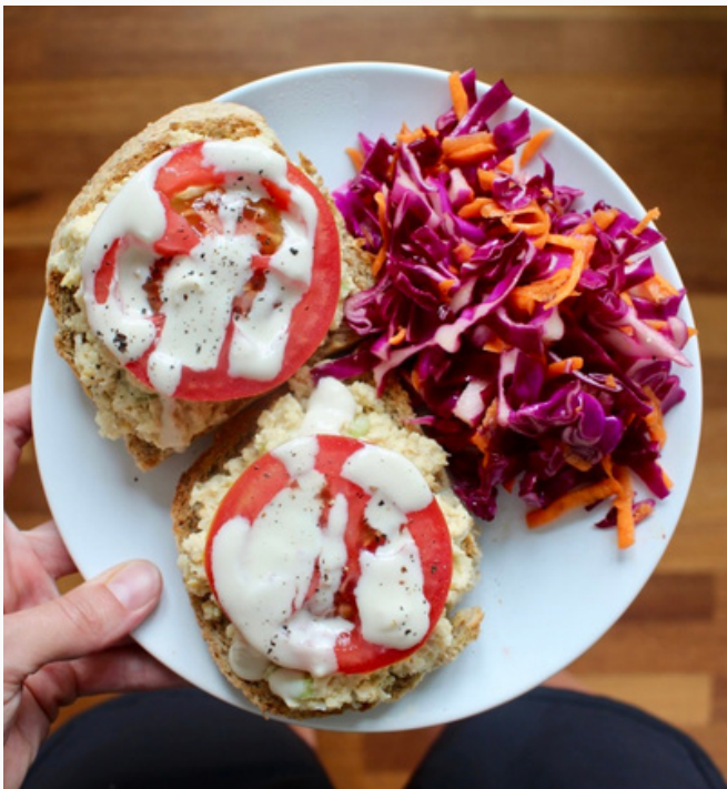
Make a chickpea salad sandwich (or open faced toasts) with the chickpea salad, tomatoes, lettuce and lemon tahini dressing. Serve with coleslaw.